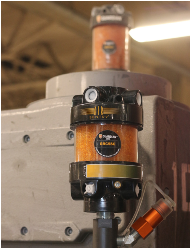
Figure 2. Air Sentry® Guardian® Desiccant Breather. Breathers like these in conjunction with OilSafe Adapters reduce contamination, moisture and particulate in equipment.