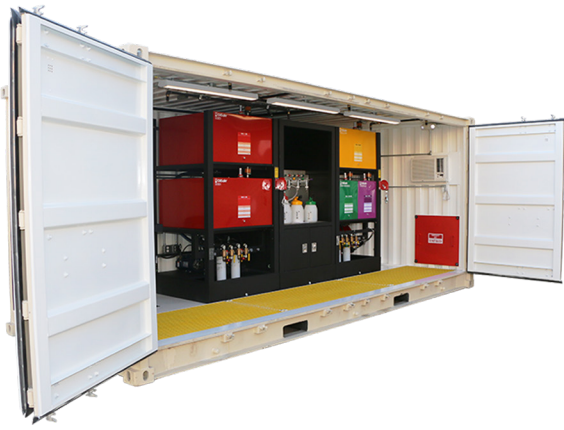
Figure 1. OilSafe® Satellite Lube Room with OilSafe Lubrication Work Center. Units like these help expand reliability and provide organised, contaminate-free lubricant storage and dispensing to remote locations or where indoor space is limited.