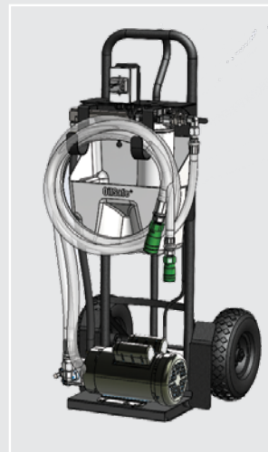
Basic - electric

System is available with a 65 gal tank and tankless option, for use with drum or tote. Both models are available with pneumatic pumps only.